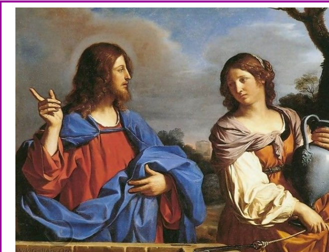
The Woman at the Well The Third Sunday of Lent

The story of the woman at the well is a rich example of love, truth, redemption, and acceptance. And best of all, not only does Jesus accept her, but He accepts us, too. He wants us all in His holy kingdom, if only we, too, believe.