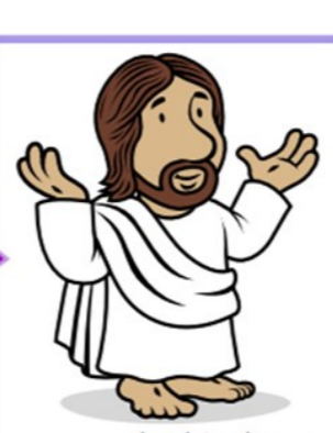
_____ days later, Jesus was raised to _____

Draw or write some of the ways we can see God's love in the world today.