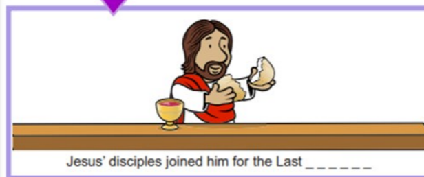
Jesus' disciples joined him for the Last _____