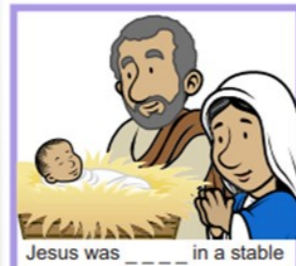
Jesus was _____ in a stable

'God loved the world so much that he gave his only Son, so that everyone who believes in him may not be lost but may have eternal life. For God sent his Son into the world not to condemn the world, but so that through him the world might be saved.'