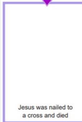
Jesus was nailed to a cross and died