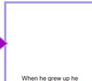
When he grew up he proclaimed the Good News