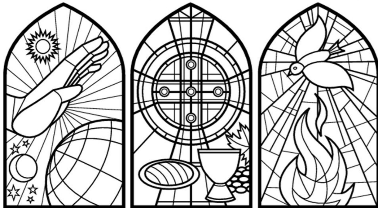
Colour in the Trinity stained glass windows.