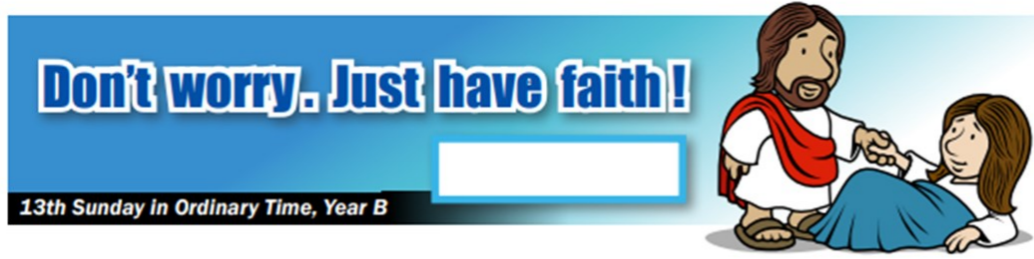
13th Sunday in Ordinary Time, Year B