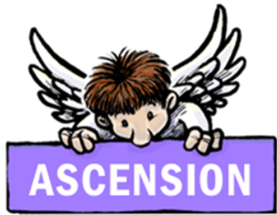
How many words can you make from the letters in the word ASCENSION?

168 Hawkesbury Road, Springwood, NSW, 2777 PO Box 4410, Winmalee, NSW 2777 Phone: 02 4754 1052; Emergency ONLY: 0474 631 168