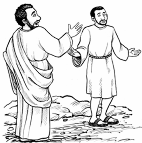
Even though Jesus ascended into heaven he is always with us. Complete the sentences below.