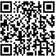
Support us! Scan to donate

Growing up I struggled to understand the Solemnity of the Ascension. This day marks the end of Jesus’ earthly life as ‘he was lifted up while they (Apostles) looked on, and a cloud took him from their sight.’ Whilst I can only imagine Our Lord’s desire to be united with the Godhead and the Communion of Saints in his Heavenly homeland I can’t help but feel humanity being short changed with his departure. Wouldn’t it benefit the faithful more if he remained here on Earth? Does his absence allow us to be more effective disciples? Are we able to live out his mission to proclaim the Gospel with him in Heaven? If this event is a cause for joy why does it seem that Christ has abandoned us by Ascending to Heaven? These questions arise when one first considers the mystery of the Ascension.