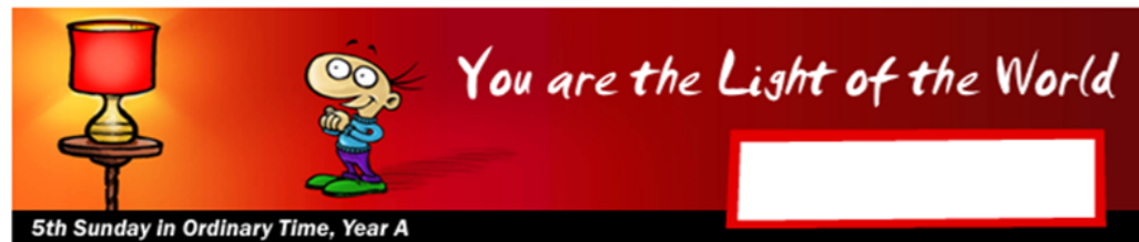
5th Sunday in Ordinary Time, Year A

Draw a picture of yourself setting a good example to others.