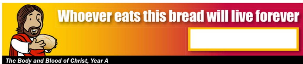
The Body and Blood of Christ, Year A

During Mass we share in a sacred meal called the Eucharist, which means 'to give thanks'. In the chalice, write down some things which we can be thankful for. In the bread, draw a picture of your family sharing a special meal.